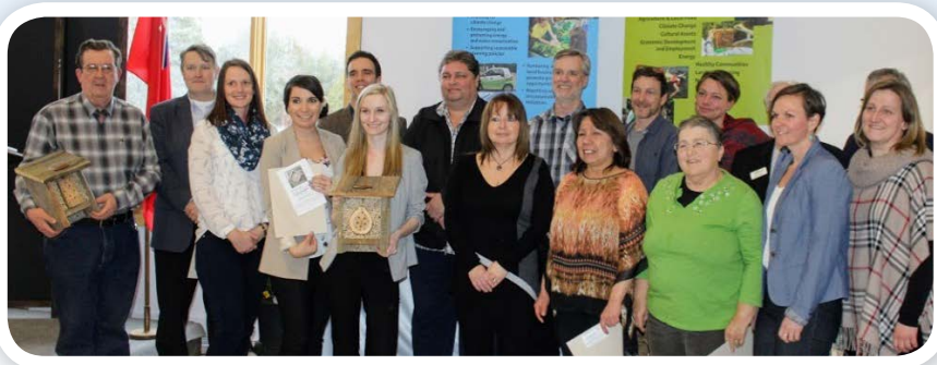
Winners of 2017 Sustainable Peterborough Partnership Recognition Awards

Photos throughout this Report Card courtesy of: Camp Kawartha, Circle Organic, City of Peterborough, GreenUP, Hiawatha First Nation, Innovation Cluster, Kawartha Land Trust, Lang Pioneer Village Museum, Municipality of Trent Lakes, Nourish, Peterborough Airport, Peterborough Pollinators